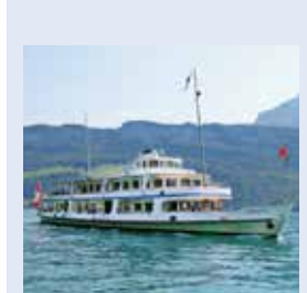
SCHWYZ Capacity 900 190 banquet seats