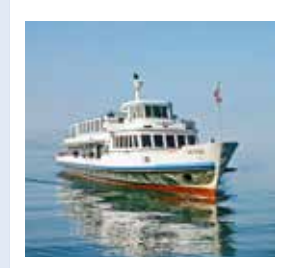
WEGGIS Capacity 500 152 banquet seats