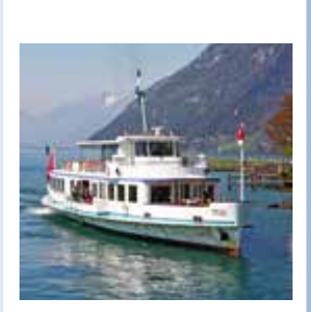
TITLIS Capacity 300 96 banquet seats