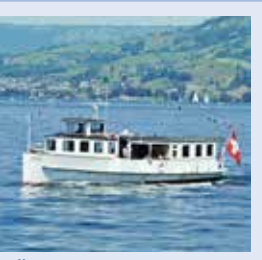
Capacity 140 36 seats