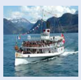
GALLIA 1913 Capacity 900 98 banquet seats