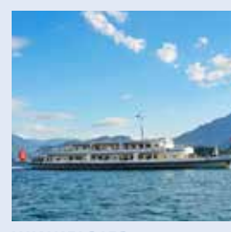
WINKELRIED Capacity 700 174 banquet seats