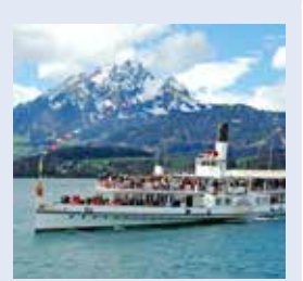
SCHILLER 1906 Capacity 900 110 banquet seats